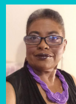
Americorp Vista Member